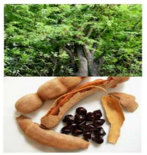
Fig.1:Plant OfTamarindusIndica Linn With Fruits And Seeds

From available literature, there's no known experiment conducted to determine the effect of Tamarindusindica on superficial wound closure. However, related studies are carried out to determine the effect of tamarind seed polysaccharide (TSP) on the repair of corneal wounds and it was discovered that TSP has a positive effect on cellular adhesion, thus promoting rapid healing [2].